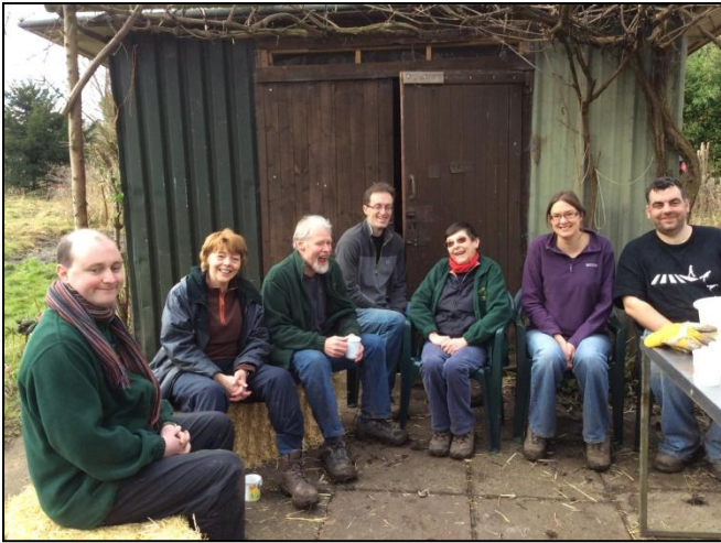
Some of the workers enjoying a tea-break

January: Volunteers started clearing the area that is to be opened to the public soon. It was a lovely, sunny day and it was great to see some new faces. All the bramble roots have been dug out and much of the ground dug over to level it out.