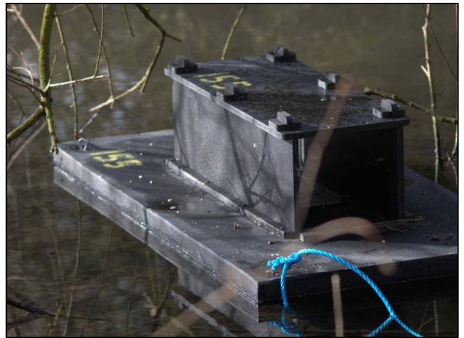
One of the new mink rafts

New mink rafts have been installed at the WWA, the adjacent Verulam Angling Club and also at a location near Sopwell House. The old wooden rafts had almost fallen apart but the new ones are made of recycled plastic so should last a lot longer. There have been no sightings of mink locally for a long time but that doesn't mean they are not around. If you see a mink on site please let the Reserve Manager know so we can step up our monitoring programme.