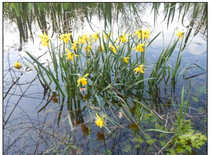
A new variety of aquatic daffodils....no watering required.