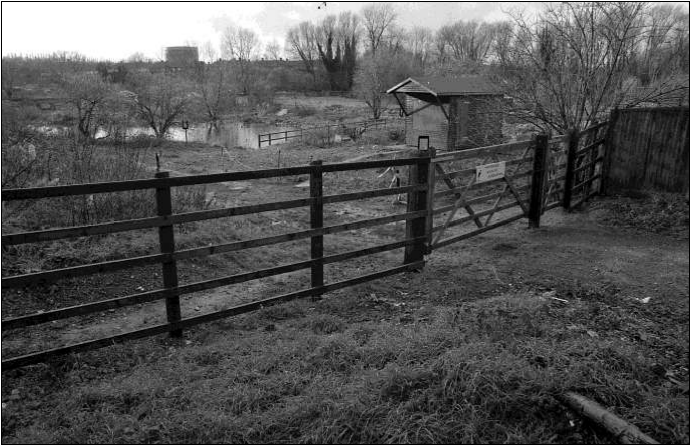
Two similar views of the entrance area - not long after the construction of the fencing and bird hide had been completed