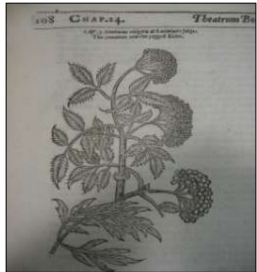
Woodcut of Elder in 17th century herbal

The cost is £8 per person, 50% of which will be donated to the Watercress Wildlife Association Nature Reserve, which will form part of the walk.