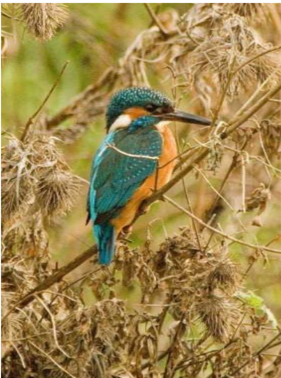
A lovely photo, taken by Keith in December 2007, of a different male kingfisher at the Reserve

Kingfishers live around streams, slow-flowing rivers, ponds and lakes where they feed on aquatic insects and small fish, such as sticklebacks. When hunting for food, they perch on a favourite branch near to the water and watch out, with their keen eyesight, for a suitable fish. The bird has to rely on memory to predict where the fish will be after it has entered the water and will sometimes return to the surface with a stone in its beak if its prediction was wrong. After it has caught a fish the bird will fly back to the perch. The Kingfisher does not eat the fish immediately and, instead, will beat it against the perch to kill it and then consume it head-first.