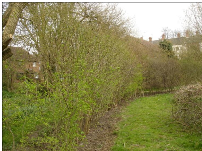
Hedge before laying

After some initial concerns that we were trying to cram too much into one day, this event turned out to be one of the most successful that the WWA has organised. The weather was perfect, the hedge laying training day was thoroughly enjoyed by all who participated, and the willow weaving activity was very popular for young and old alike. And to top it all, the Association laid on a BBQ to feed all the workers and helpers.