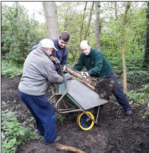
Trying to shift the Dogwood stump proved challenging

One of the areas that was cleared recently is just beyond the second bridge where there is a stand of alder trees. These were planted 25 years ago but were getting choked with dogwood. It took three or four of our work parties to remove them all, along with the stumps.