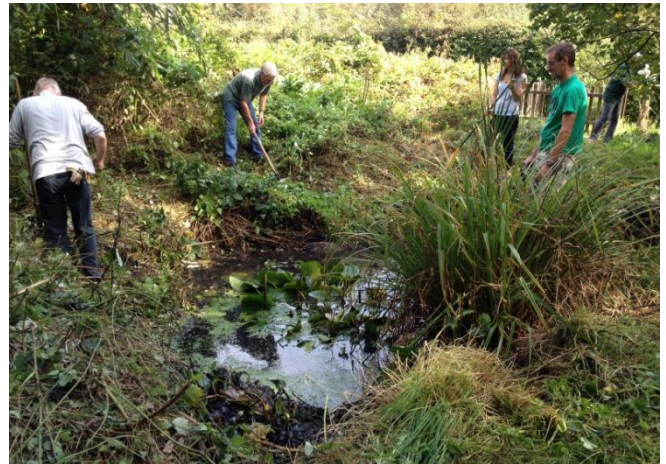
Clearing the pond and surrounding area