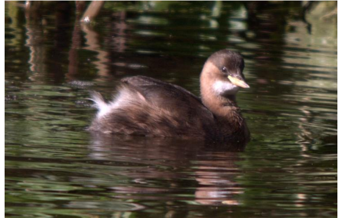
One of our visiting Little Grebes

There have been some quite interesting sightings, the loveliest being two Little Grebes popping in at various times. There was a brief visit of a Grey Wagtail but it seems to have disappeared again. Two cygnets turned up back in the summer but one was found dead, and it looked like it could have been attacked by a fox. There have been many sightings of a large fox so it is quite a reasonable assumption. The other cygnet disappeared soon after.